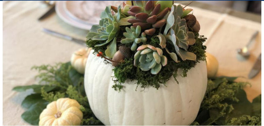
The pumpkin succulent center pieces will be raffled off during the event.