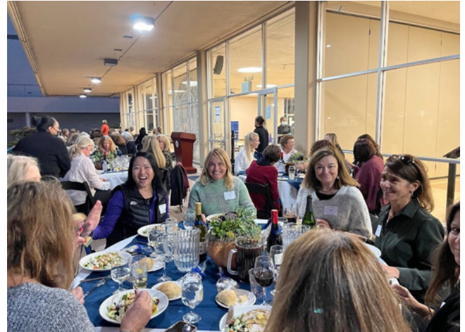
Fall Dinner 2021

"A generous heart is always open, always ready to receive our going and coming. In the midst of such love we need never fear abandonment. This is the most precious gift true love offers - the experience of knowing we always belong."