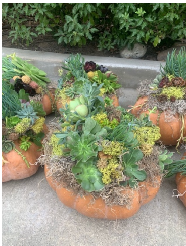
Centerpieces created by the Gardening Circle