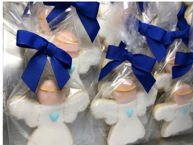
Angel cookies created by the baking circle.