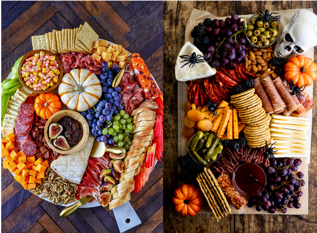
Examples of charcuterie boards!

In November the baking social circle will continue “A Year of Sweet and Savory” with our next savory event Grazin’ Through the Holidays on Sunday, November 7 th at 11:00AM. The group will be focusing on charcuterie boards. Donna will be teaching how to bake yummy homemade crackers and breadsticks for our boards. Everyone will also learn how to portion a board based on guest number; how color, texture and flavor play into your board; and how to make it festive for the upcoming holidays. We will even make a dessert charcuterie board!