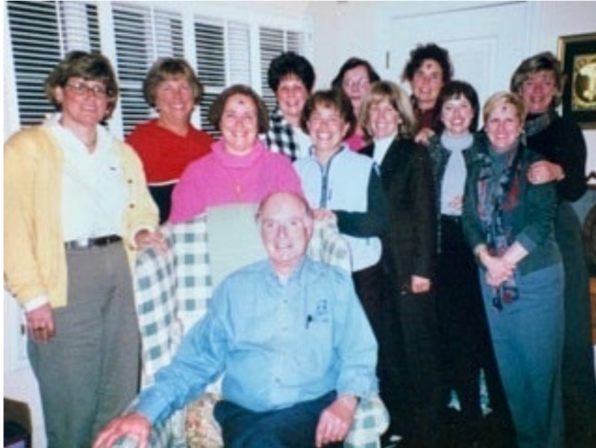
The first AMEN meeting, held on Feb. 28, 2001