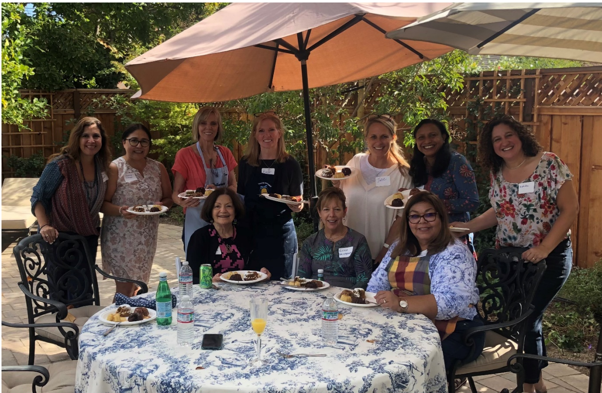
Nothing Bundt Bells event – Note: There were many tips shared at the event.

https://www.dixiecrystals.com/recipes/Almond-Amaretto-Poundcake