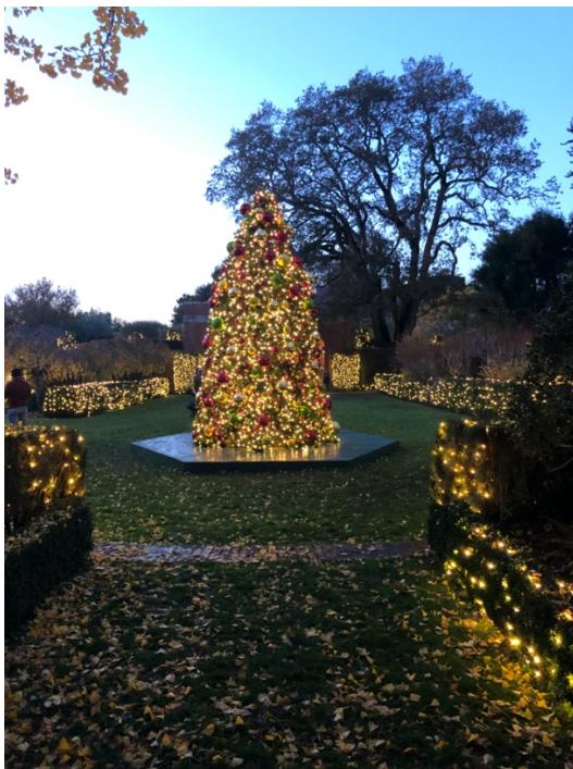
Filoli Gardens, Woodside, CA

For more information visit the Filoli website HERE .