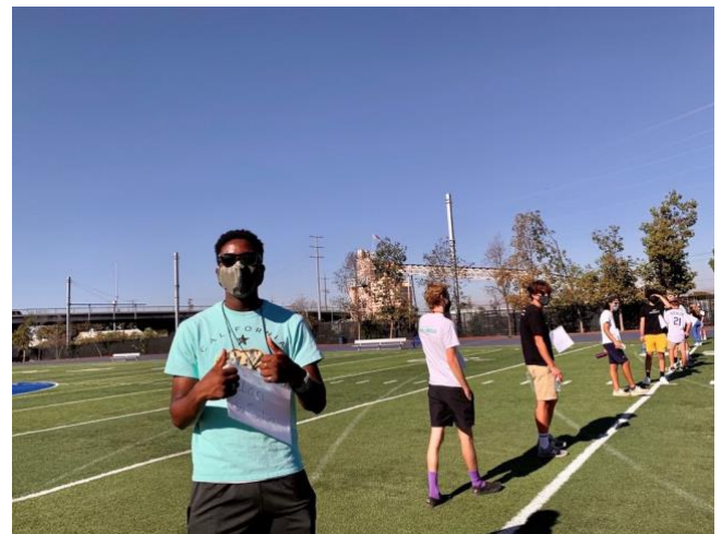
Senior models on the first day of rehearsal Oct. 18

Models were selected for the event via an outdoor, socially distanced casting call that saw a fantastic response on September 27. The tryout was overseen by celebrity judges with a variety of runway and TV experience, and an agent from Look Model Agency.